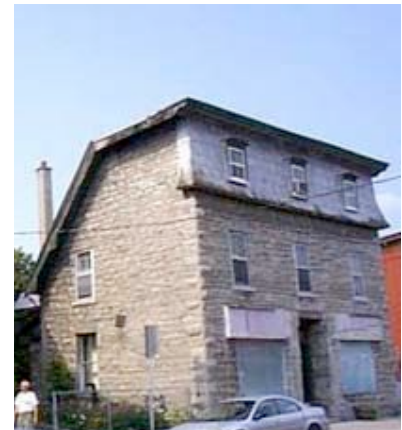
Magee House c1880