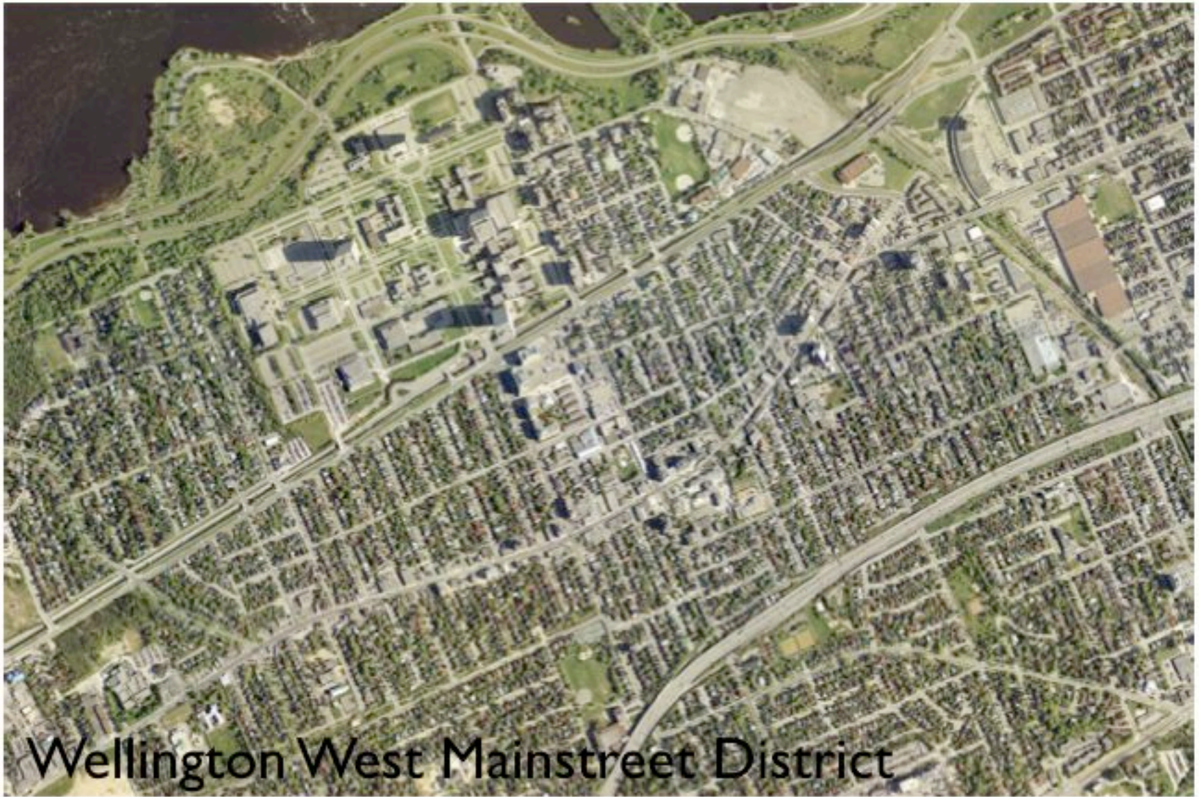
Wellington West Mainstreet District